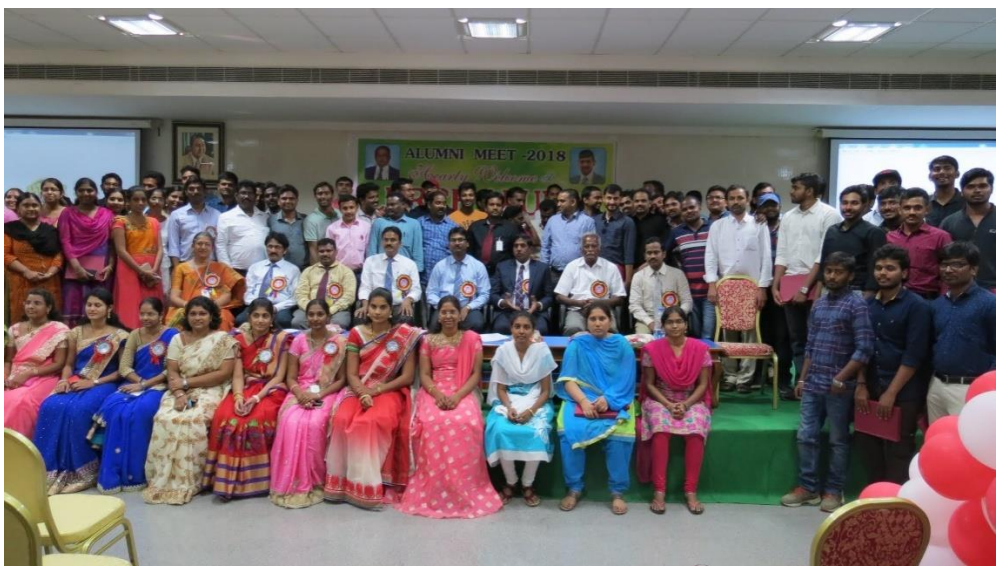
Group Photograph of Alumni Meet - 2019