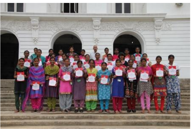
The winning NCC team posing with the Director

➤ LBRCE NCC Students participated in the District level NCC/ARMY GRIG Training program for WOMEN and bagged prizes in different events like Throw ball, Rifle shooting.