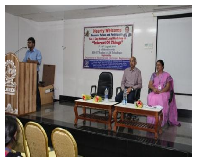
A still from the inaugural of the workshop on IOT @ EEE