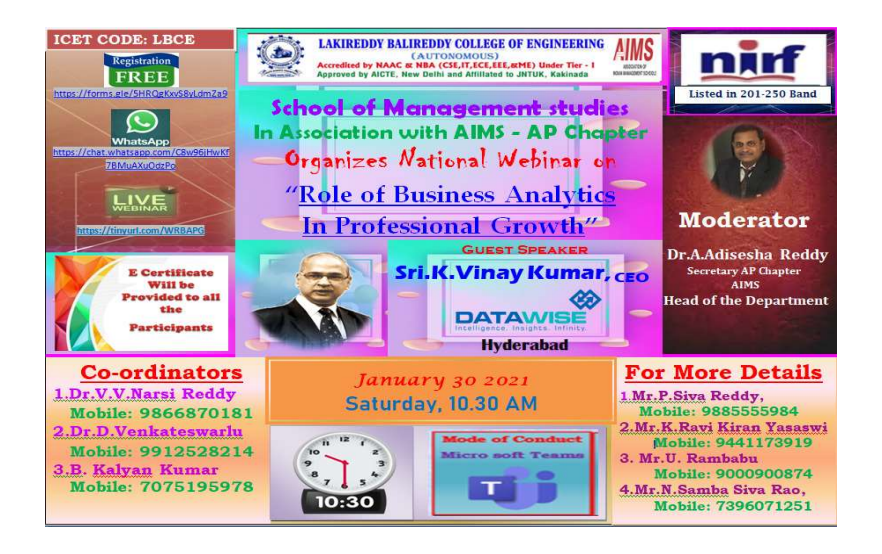
Fig: Event Poster