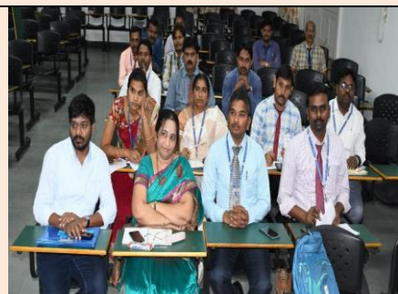
Dept. of CSE & IT Faculty participated in FDP