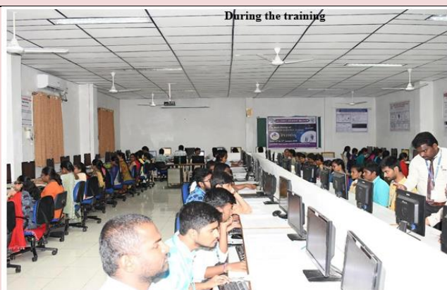
Students are practicing Python fundamentals during the training program

Workshops/Seminars/Certification programs conducted: Seminar_01 (Under CSI)