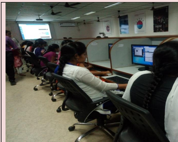
Programming Contest conducted to II, III, IV B.Tech CSE Students