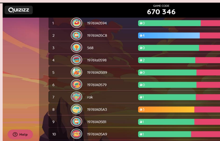
Leader Board of Programming Quiz conducted to I B.Tech CSE Students