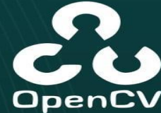
Image Processing using OpenCV