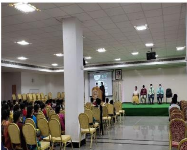
Title: Inauguration on Image Processing using OpenCv