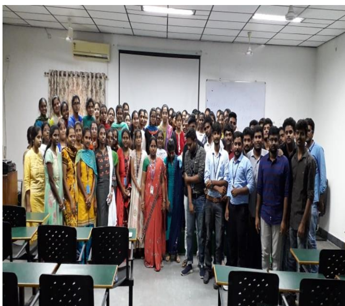
Students participated in Association