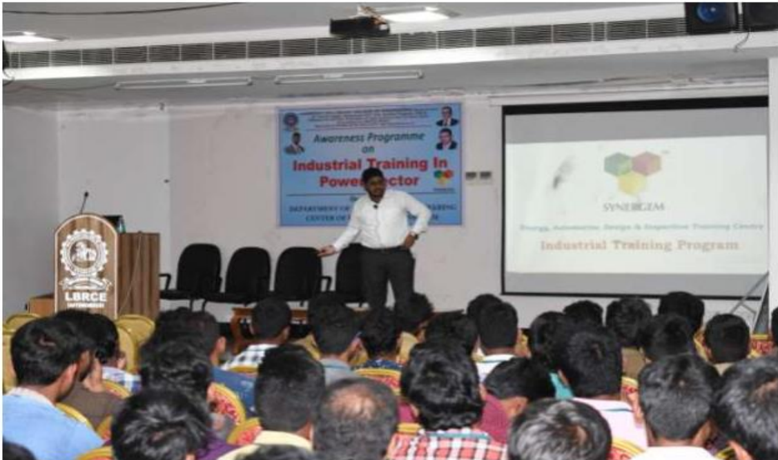
VI and VIII Semester Student Participants