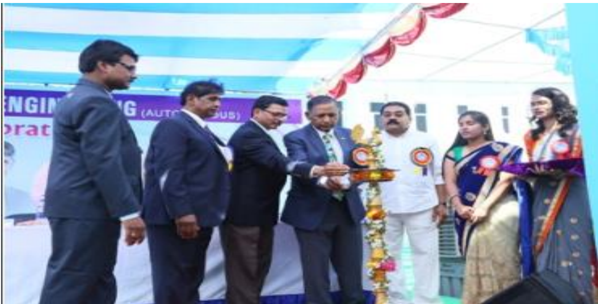
Inauguration of Annual Day celebrations by Management and Principal