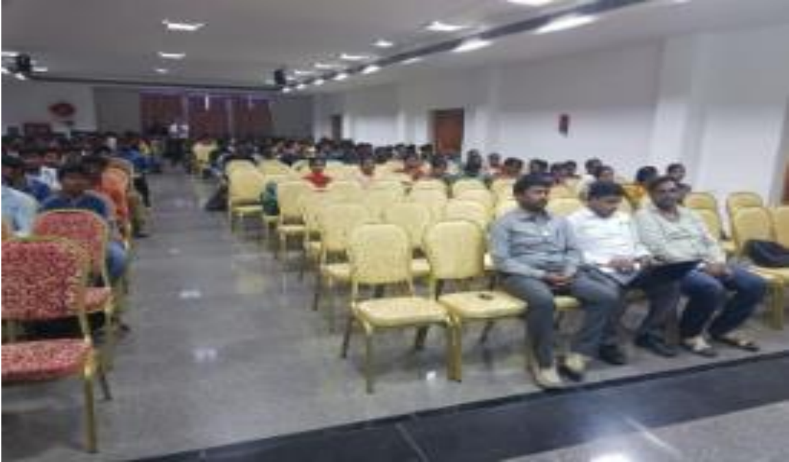
IV year student participants with faculty