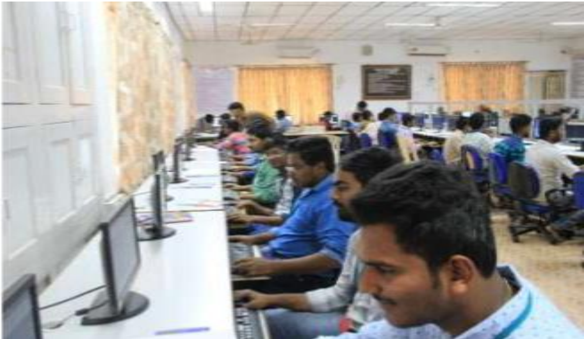
Second year student participants in practice session