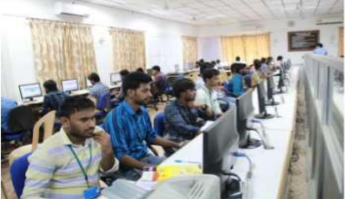
Student participants in practice session