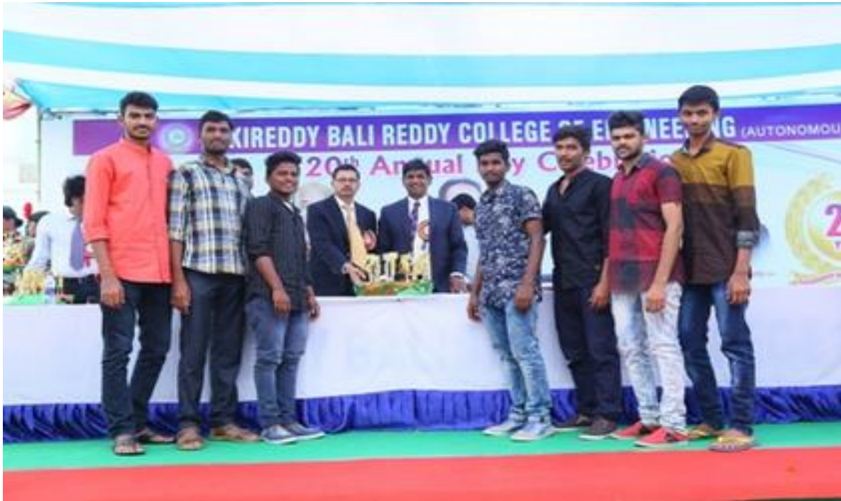
Mechanical Engineering students in Annual Day celebrations