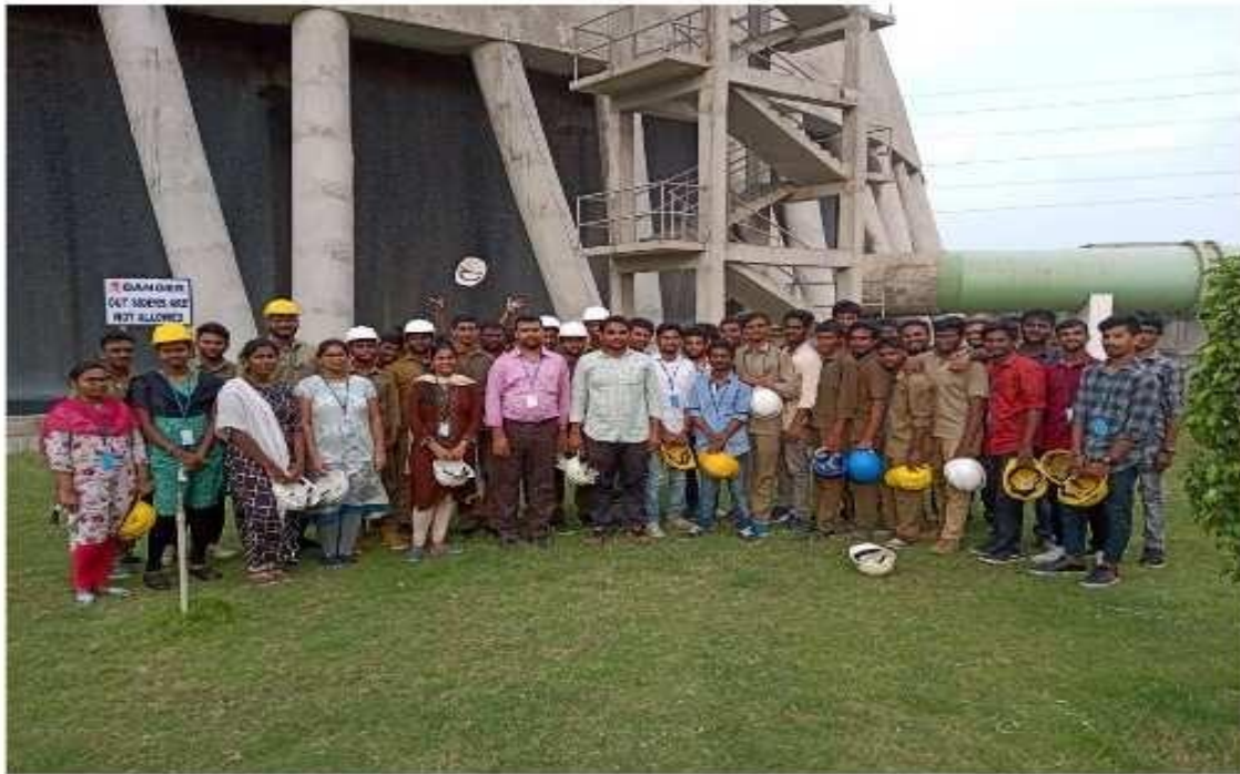
Group photo in front of Cooling Tower