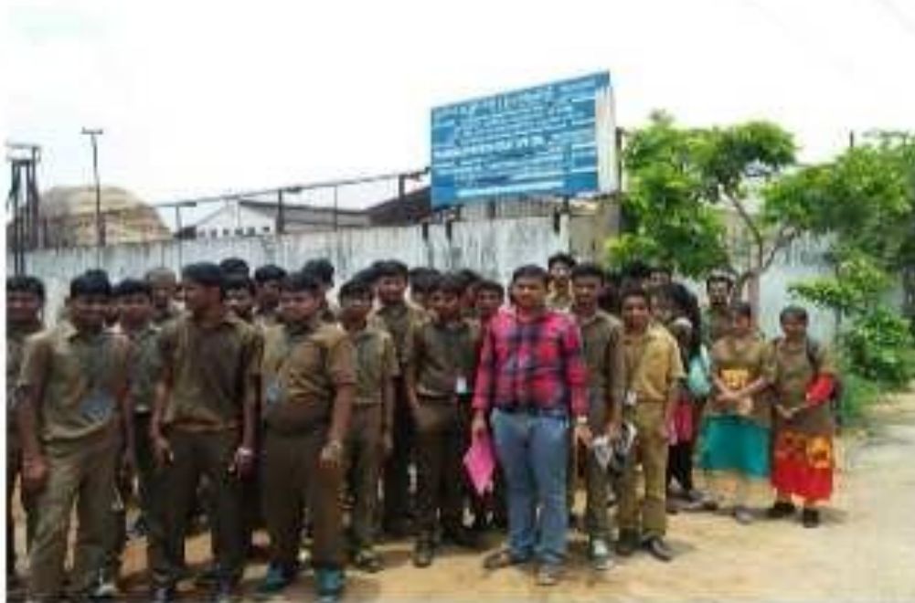
III Semester A section students group photo at M/s Prakasa Spectro Cast Pvt Ltd