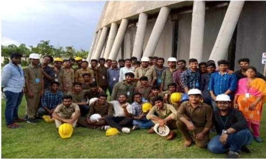
Group photo in front of Cooling Tower