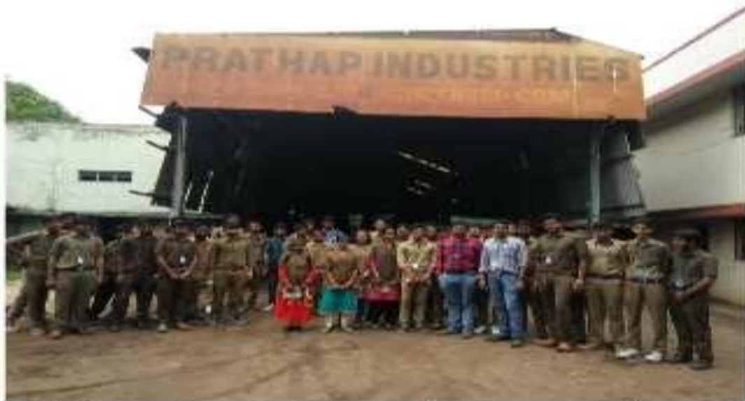
III Semester A section students group photo at