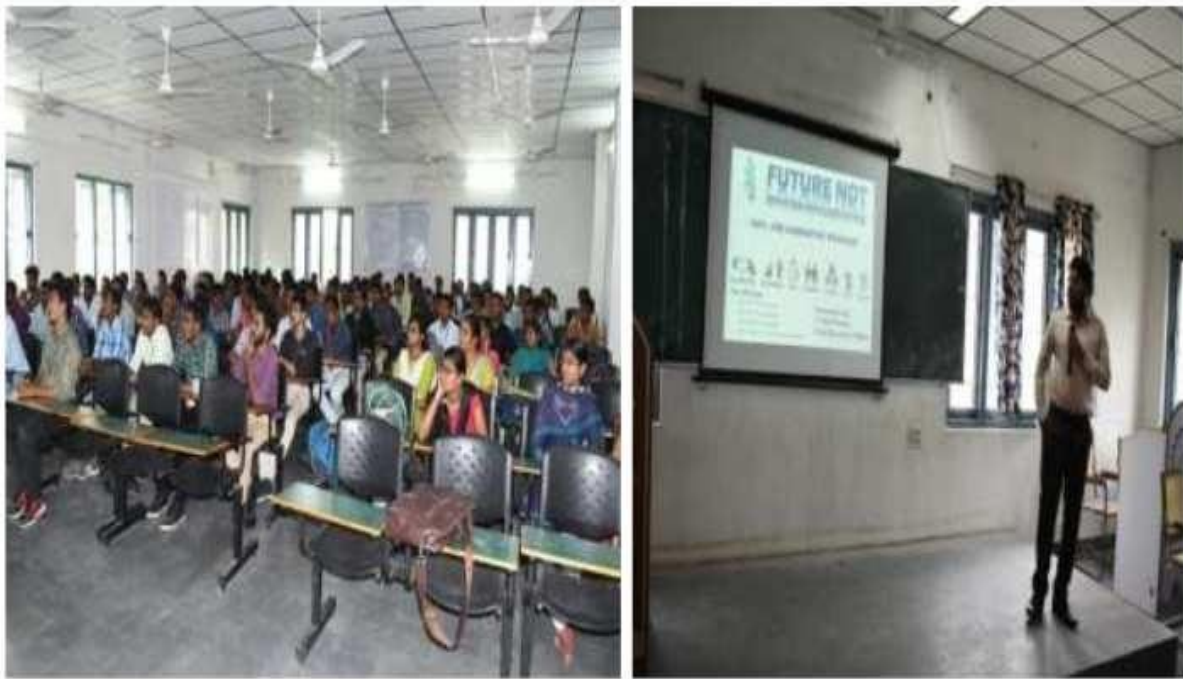
IV B.Tech student participants