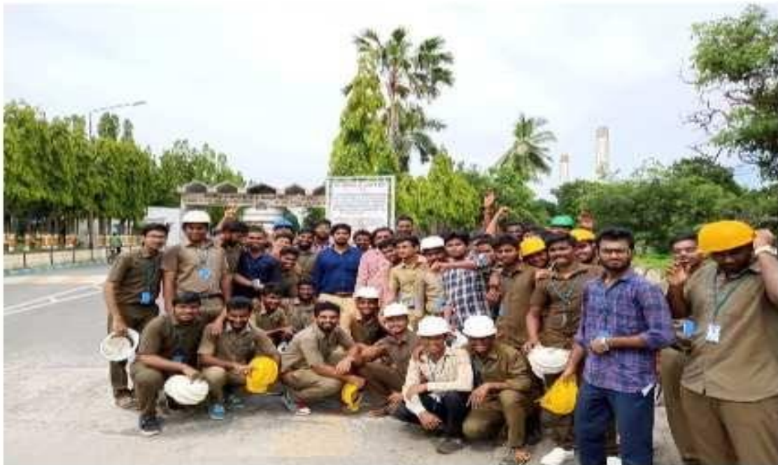
Group photo in front of Dr.NTTPS, Ibrahimpatnam