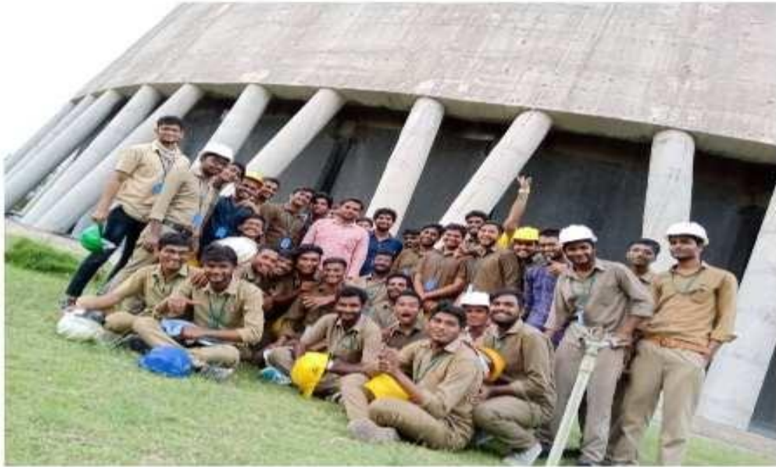
Group photo in front of Cooling Tower