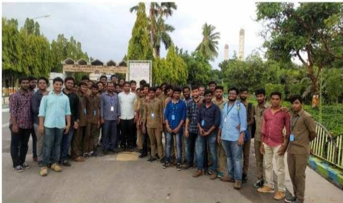
Group photo in front of Dr.NTTPS, Ibrahimpatnam