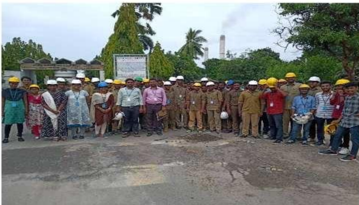
Group photo in front of Dr.NTTPS, Ibrahimpatnam